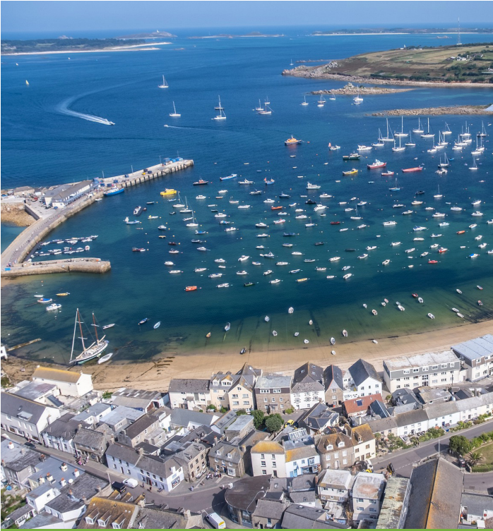
Photo: Hugh Town, Isles of Scilly.